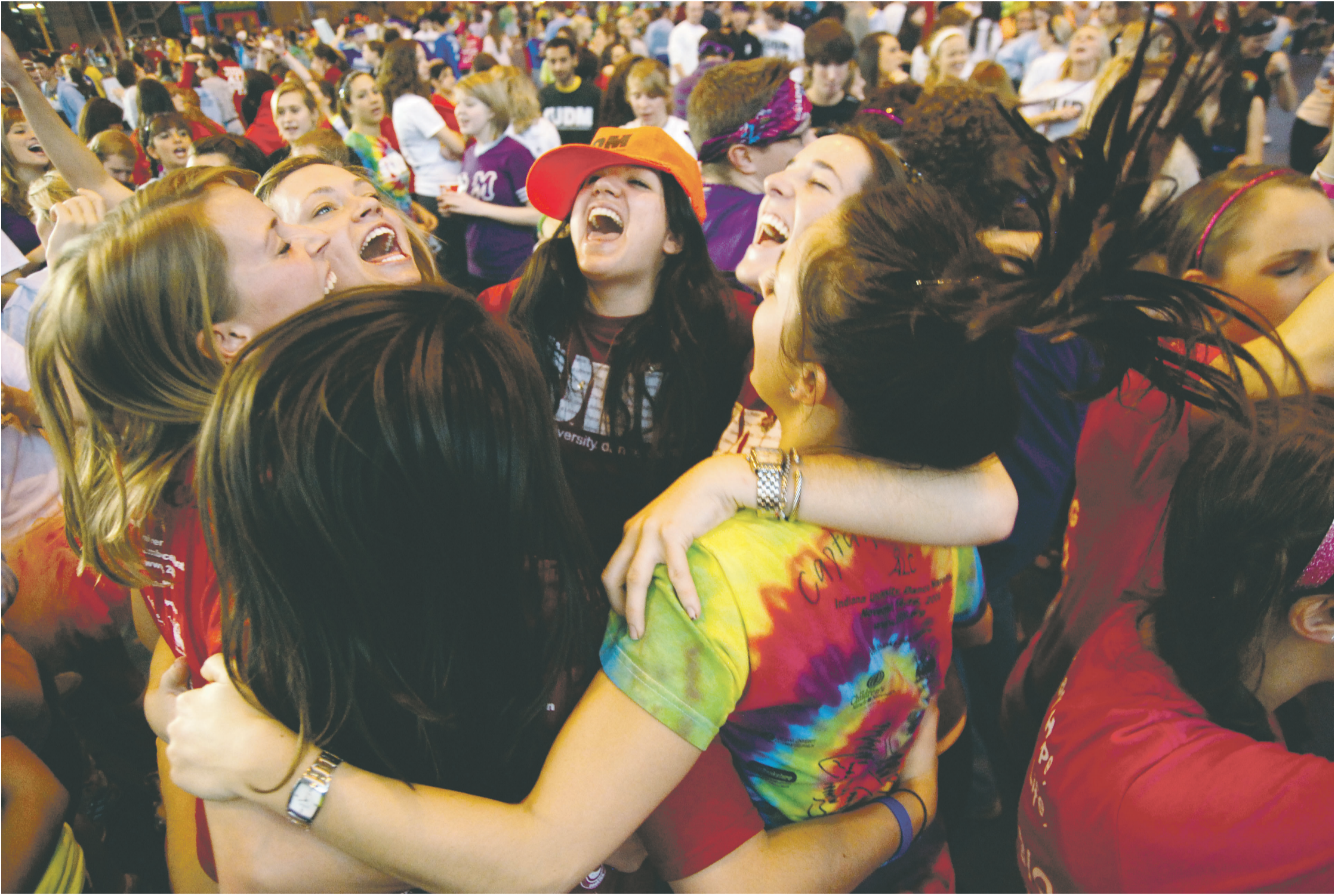
Members of the IU Dance Marathon morale committee, made up of last year's seniors, dance while the loudspeakers play 1990s songs Saturday at the School of Health, Physical Education and Recreation. Music played between live acts and stories from families helped by Riley Hospital for Children in Indianapolis.

IU Dance Marathon raised more than $1.52 million for Riley Hospital for Children in Indianapolis during a 36-hour marathon that included line dancing, contests and a talent show.